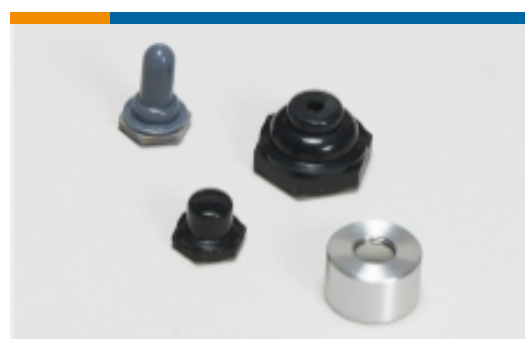
Switch Seals & Accessories(10)